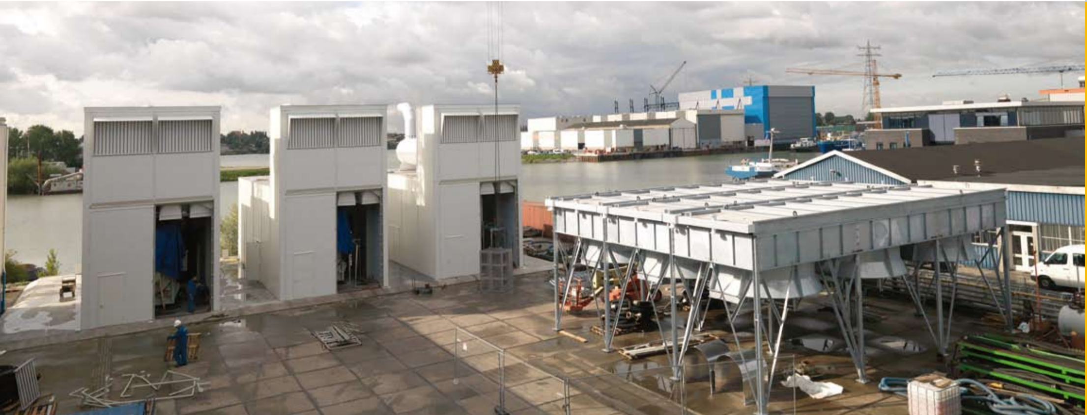
Shell Pearl GTL, EDG test set up.