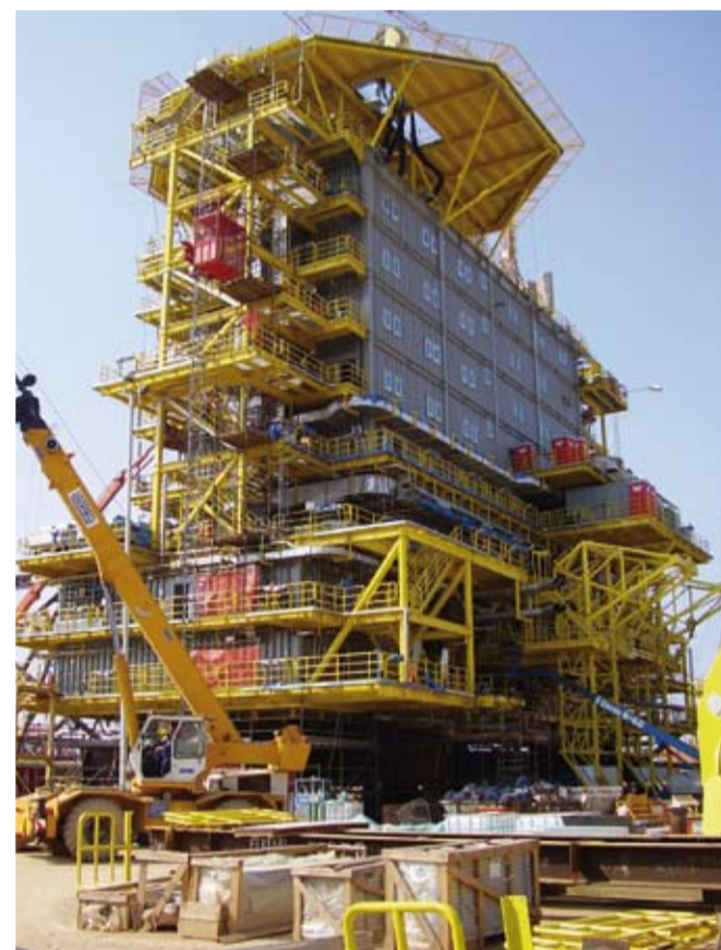
Halfdan BC platform under construction at Rosetti Yard, Italy

To ensure that the engines would operate perfectly in the event of any power failure, Pon Power Oil & Gas actually tested the engines twice: first at their own facility in the Netherlands, and again onsite in Italy. "Testing the engines as rigorously as this ensures that the risk of anything going wrong is kept to an absolute minimum," explains Jeroen. "In fact, we tested the engines for 72 hours each during commissioning – and both worked perfectly throughout the entire testing period." Both engines were also certified to the strictest international safety standards.