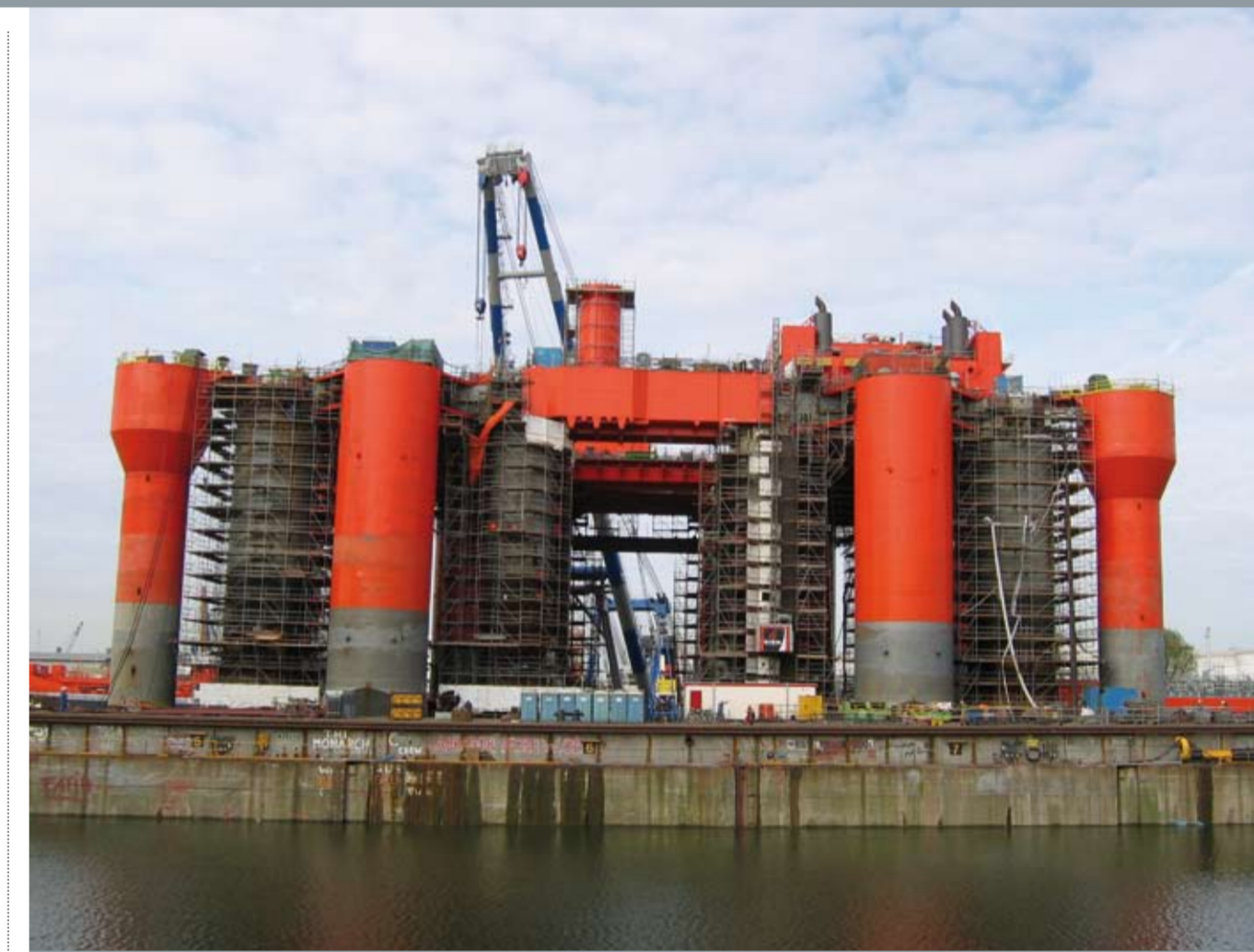
Blackford Dolphin Rig, Fred Olson Energy ASA

Throughout the project, Pon Power Oil & Gas worked closely with a number of partners, including vessel conversion and modification specialists Keppel Verolme, and engine packaging company Topec. In fact, thanks to the high level of cooperation between Pon Power Oil & Gas and Topec, the entire installation and testing phase was completed within just twelve weeks.