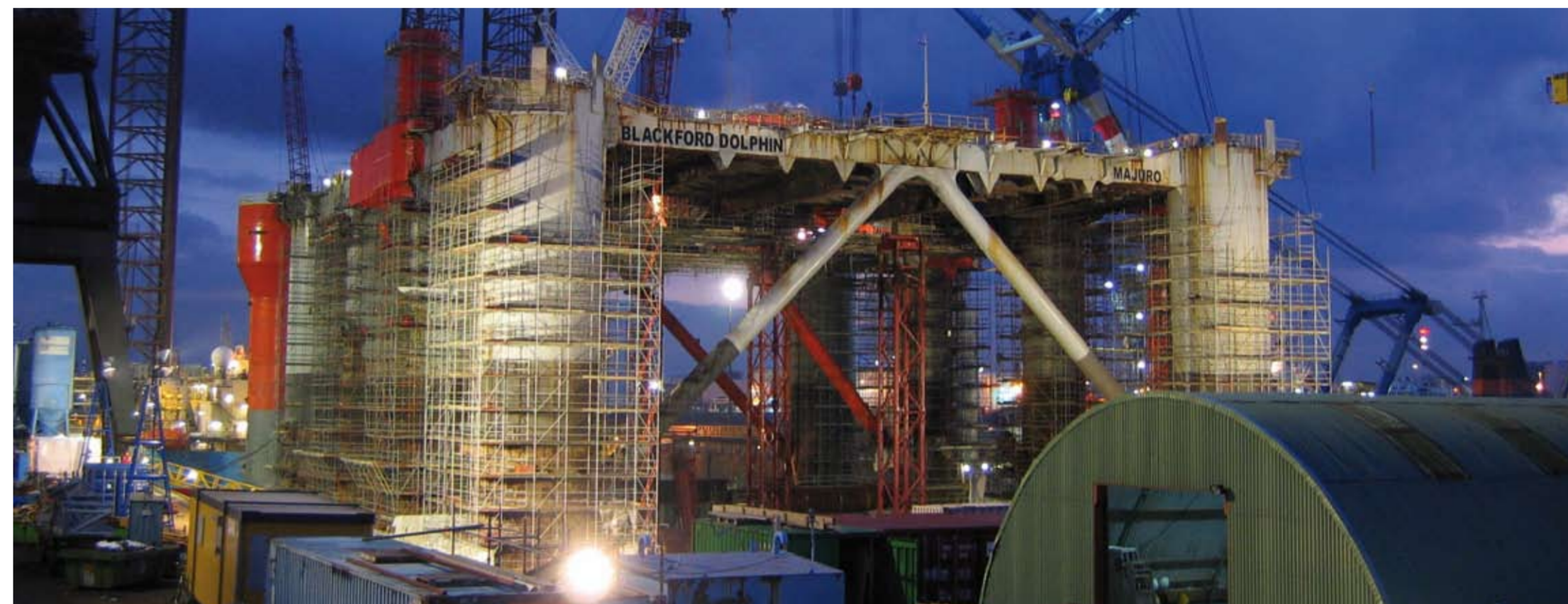
Blackford Dolphin Rig, Fred Olson Energy ASA