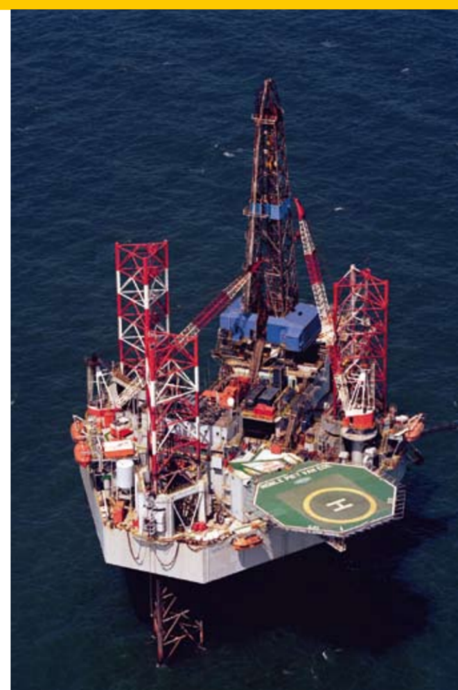
Piet van Ede platform, Noble Corporation