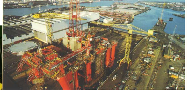
(Above) Borgland Dolpgin Drill Rig at the Harland & Wolff shipyard in Ireland