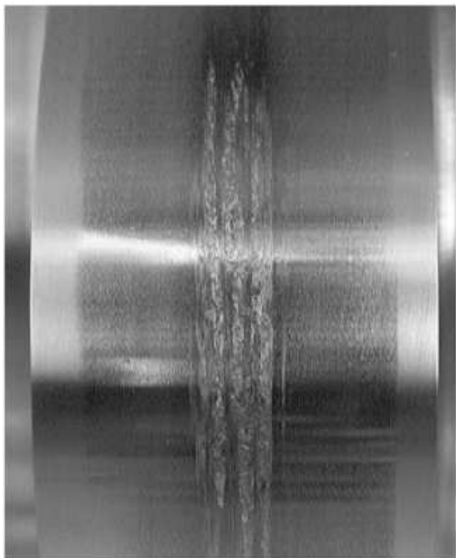
Illustration 1 g01618575 Spalling on the downward side of the camshaft lobe

For 16 cylinder engines, this option is currently available through a request for Design to Order (DTO).