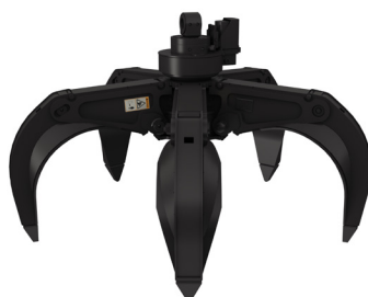
ORANGE PEEL GRAPPLES